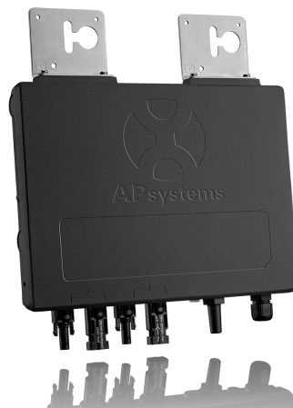
YC600: Dual-module (2:1)