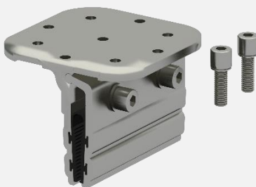
Klip-lok Interface for longline 305