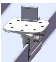
Install with Cross Connector Clamp