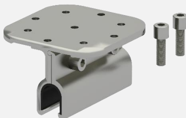
Klip-lok Interface 406 with U-opening